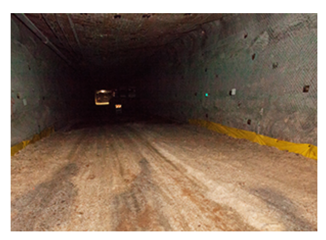
Brattice cloth placed on the floor of the repository and covered with run of mine salt

Although the pathway has been established, a significant number of activities, including installation and testing of interim and supplemental ventilation; completion of safety documentation and safety management program development; management assessments, and operational readiness reviews, will be necessary before waste emplacement can resume.